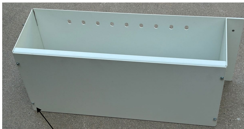
8-32 Steel Pan Head Screws with Spring Lock Washer