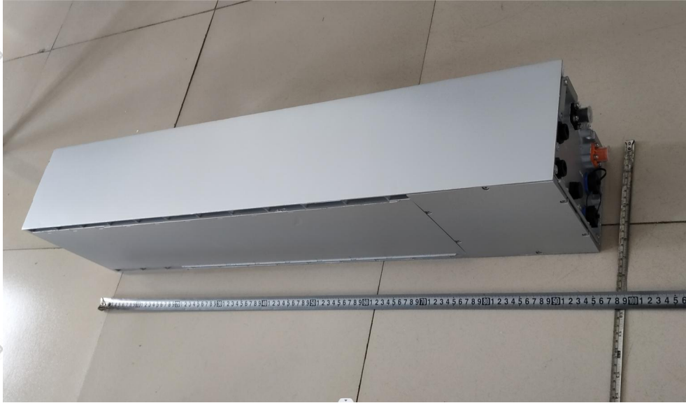
Figure 1 Overall view I of battery (电池外观图I)