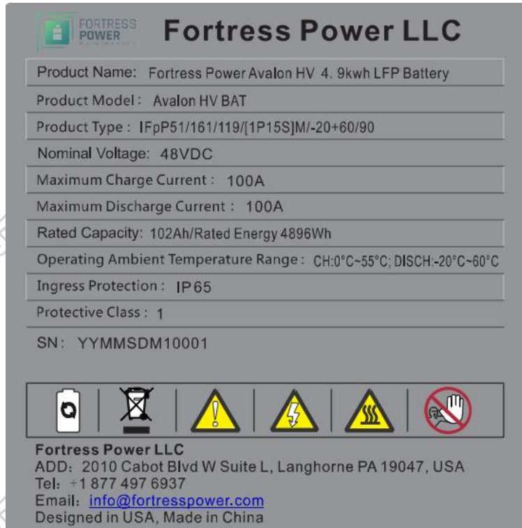
Figure 3 Battery Label (标签图)