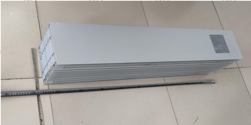
Figure 2 Overall view II of battery (电池外观图II)